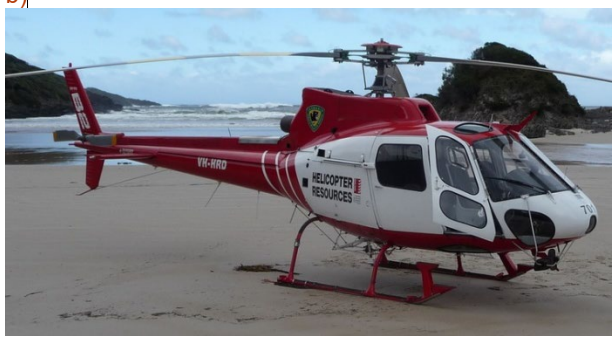
Figure 1: Examples of geophysical survey aircraft, a) Cessna 210 fixed-wing aircraft and b) Airbus AS350-B2 helicopter.