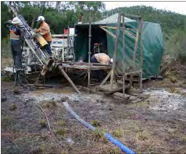
Flat remote area showing difficulty of draining drill water.