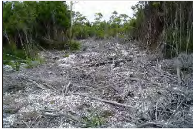
Track rehabilitation — January 2003.