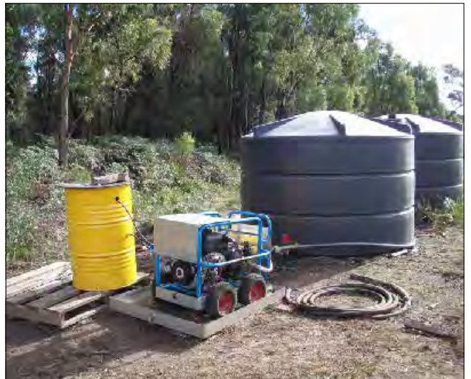
Excellent fuel tank setup contained within the yellow drum which acts as the bund.