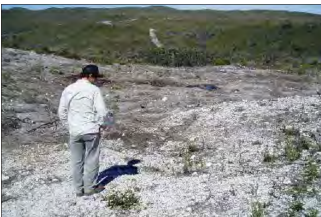
Balfour — Jute mesh site, 2005.