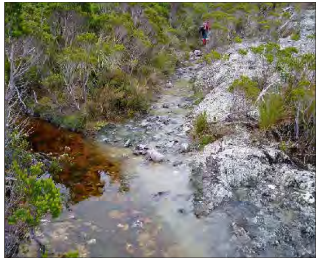
Creek contamination from drill water.