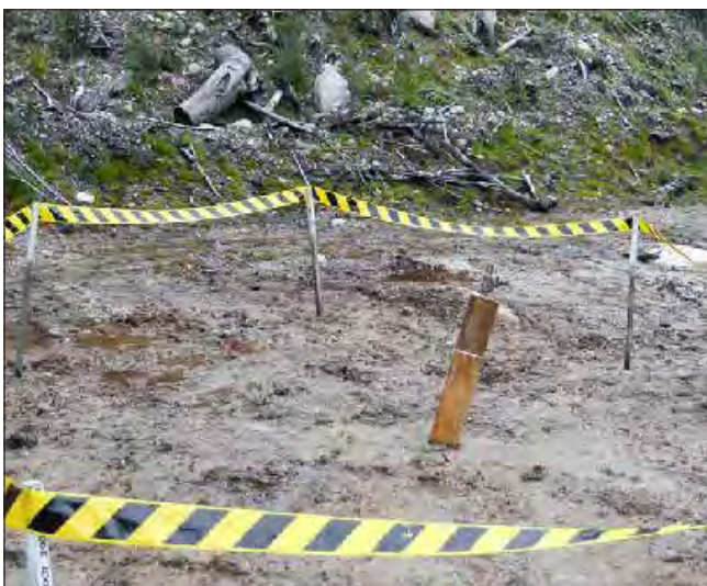
Three attempts to seal hole with eventual success at great cost. Note no solid secure collar.