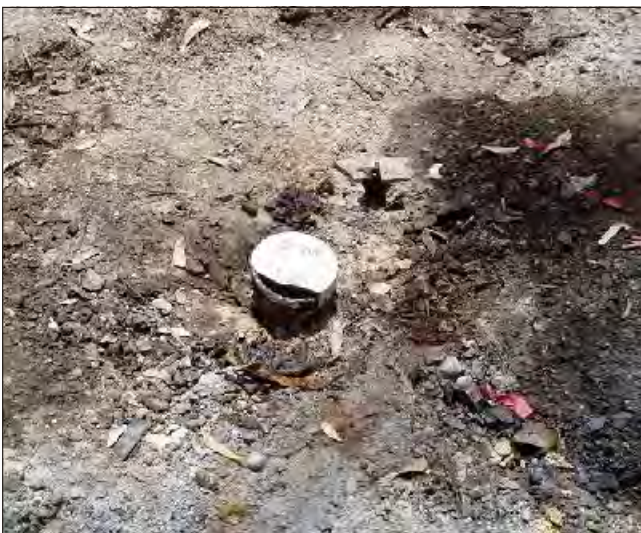
Broken PVC cap on steel collar.