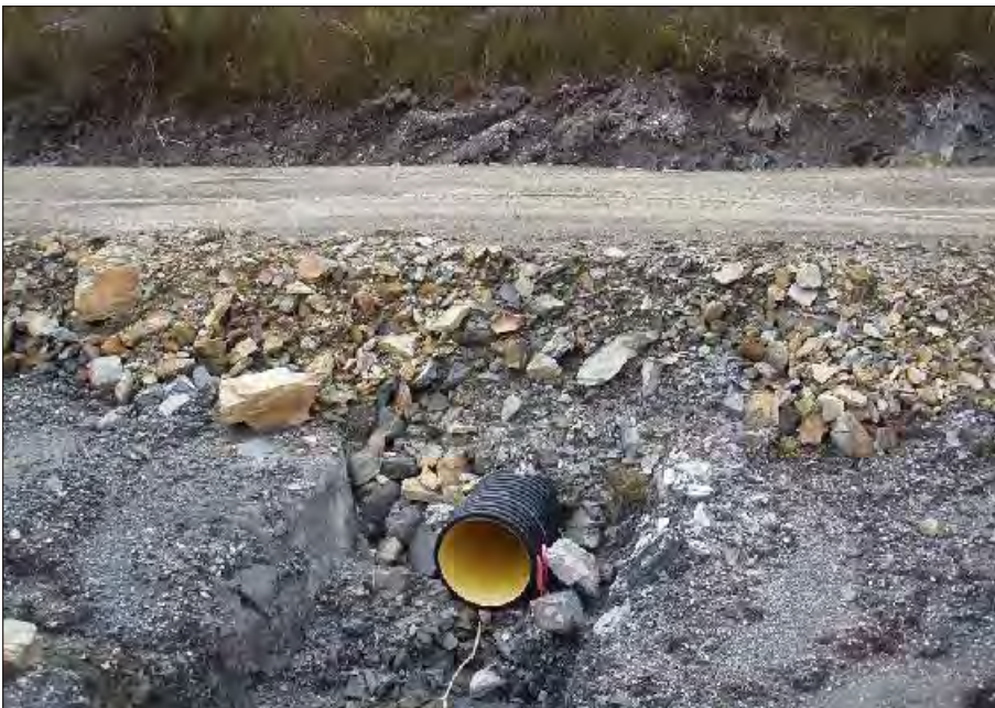
Note rip rap in discharge area and good foundation.