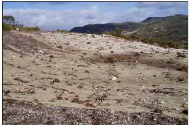
Balfour — Jute mesh site soon after spreading, 2004.