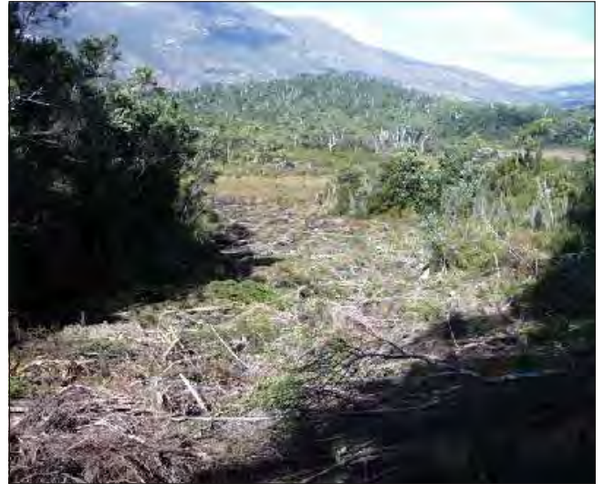
Drill track soon after rehabilitation.