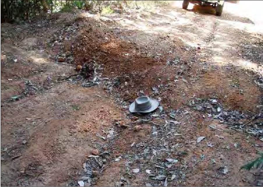
Angled grip, approximately 0.6 m wide and 0.3 m deep.