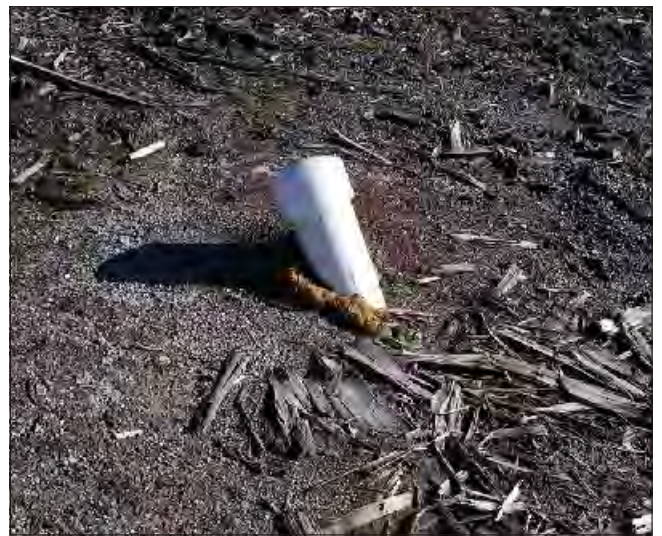
Solid PVC collar and cap — no number.