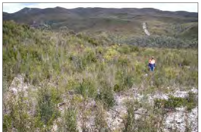
Balfour — Jute mesh site, October 2011.