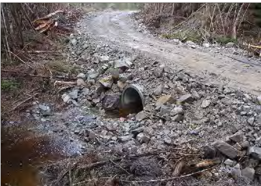
Well constructed concrete pipe culvert.