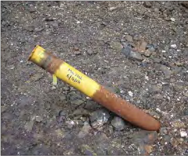
Steel collar — secure, sealed, but number will fade.