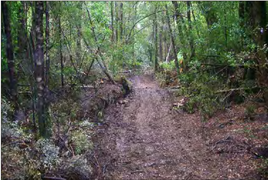
ATV track developed to access a drill site.

moderate slopes or short term drill tracks accessed by tracked vehicles.