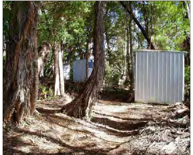
Garden sheds as individual bedrooms.