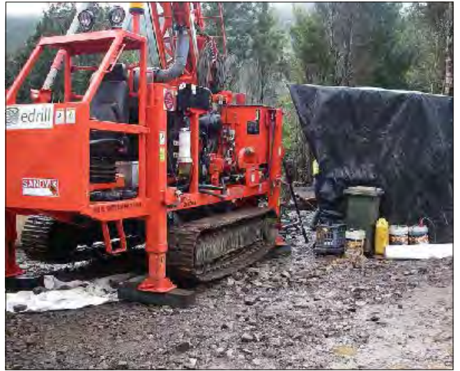
Drill site. Note oil absorbent matting under the rig.