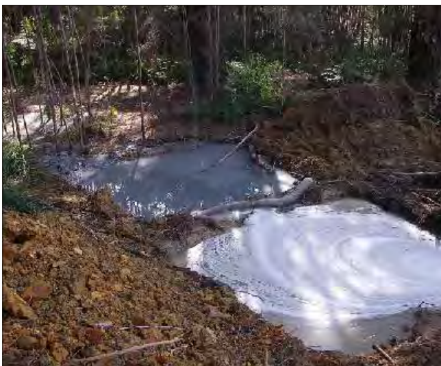
Dual excavated sump (above) and triple excavated sump (right).