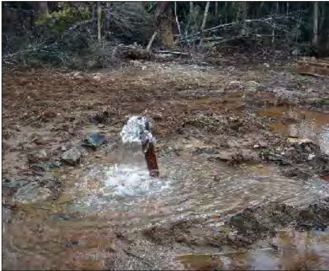
Drill hole making water.