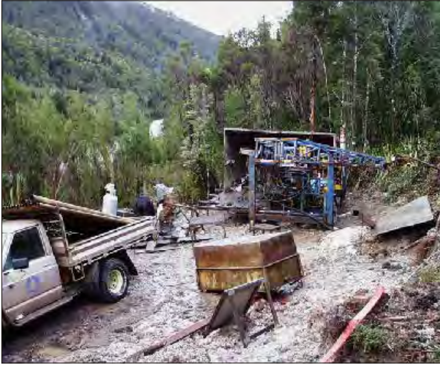
Drill site rehabilitation adjacent to Jukes Road — July 2001