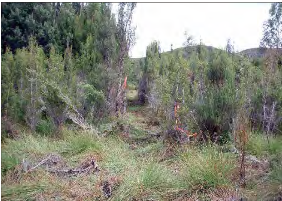
Grid line showing width and removal of trip hazards