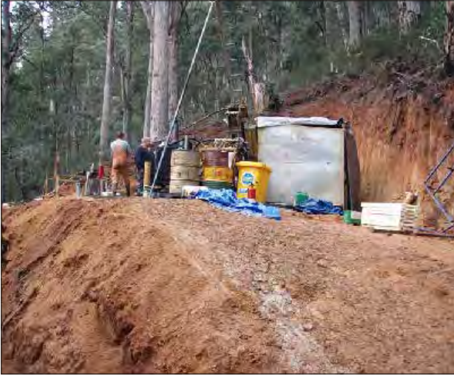
Drill site rehabilitation at Lorinna — July 2007