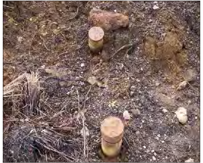
Steel collars — secure, sealed and permanent welded number.