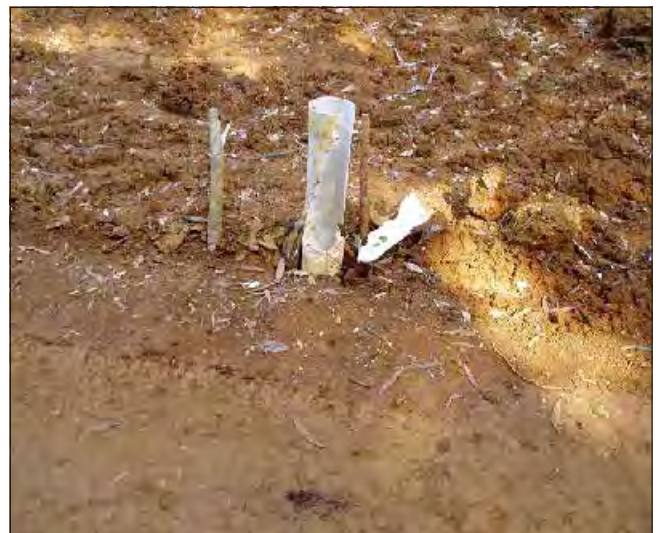
Smashed unsealed PVC collar.