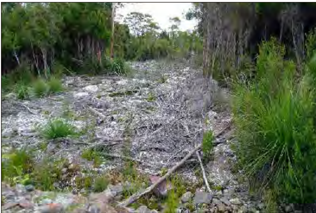
Track rehabilitation — February 2006.