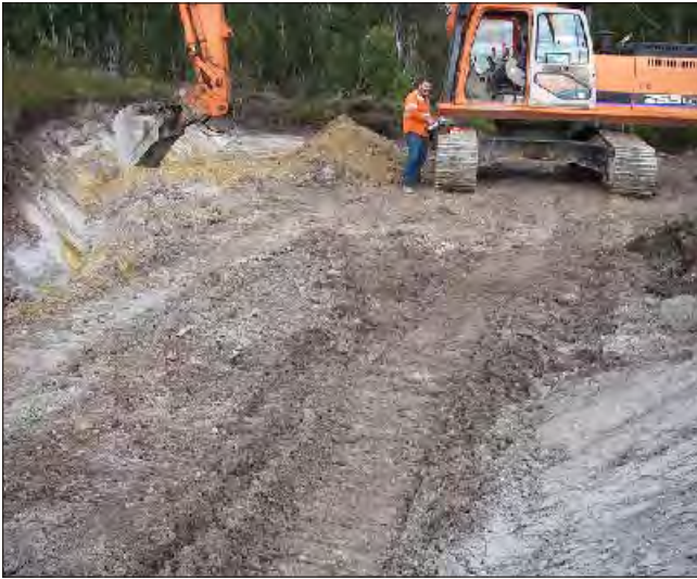
Drill site preparation — note drainage on top side of the pad.