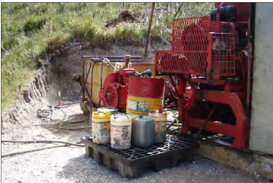
Bunded hydrocarbon storage — but no tarp or roof cover.