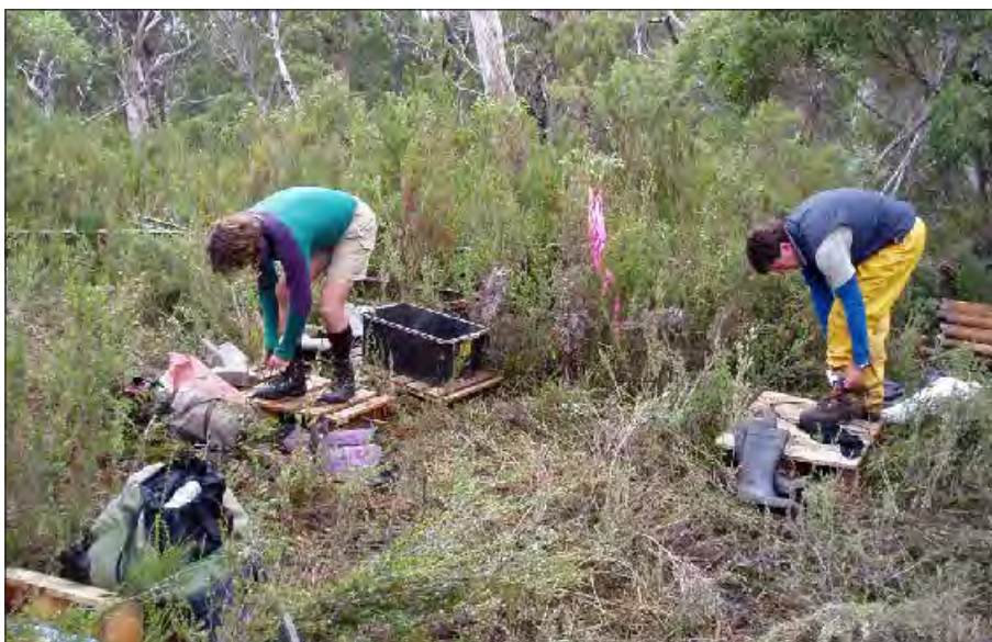
Phytophthora cinnamomi wash down station in the field.

Myrtle wilt is a natural fungal disease which kills myrtles, especially where the tree has been damaged or disturbed. It is recommended that disturbance to myrtle roots and damage to limbs and trunks be minimised to stop the spread of myrtle wilt.