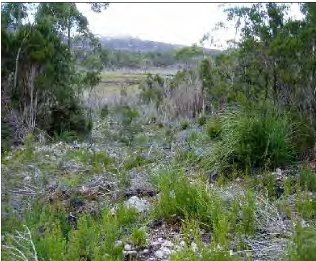
Drill track four years after rehabilitation.