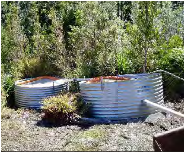
Excellent example of remote area above ground sumps — note oil absorbent mat and sausage.