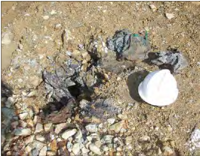
Open hole jammed with grease-soaked rags.

Refer to the chapter on Rehabilitation and Revegetation for timing, seeding rates and details on fertiliser types to be used in rehabilitation.