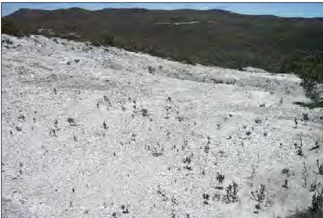
Balfour — Jute mesh site before spreading, 2002.