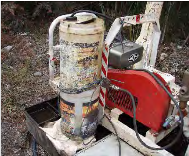
Poor bunding (filling with water) and jury rigged fuel supply to pump.