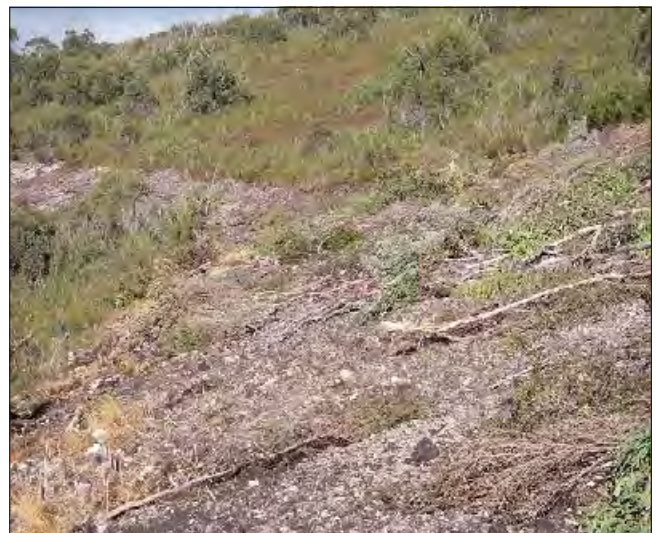
Tea tree and eucalypt slash.