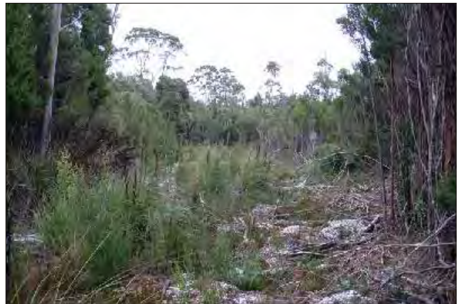
Track rehabilitation — October 2010.