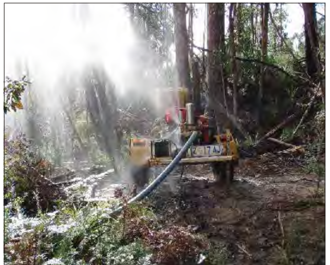
Water spraying from pump and fuel tank with no bund — very poor practice.