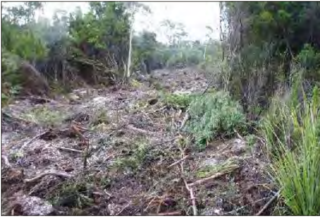
Track rehabilitation using stored topsoil and vegetation — July 2001.