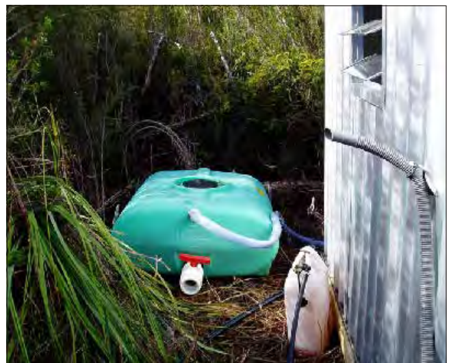
Large capacity sewage storage.