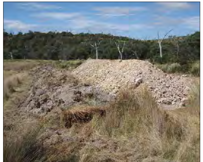
Costean at Rushy Lagoon showing topsoil and gravel stockpiles.