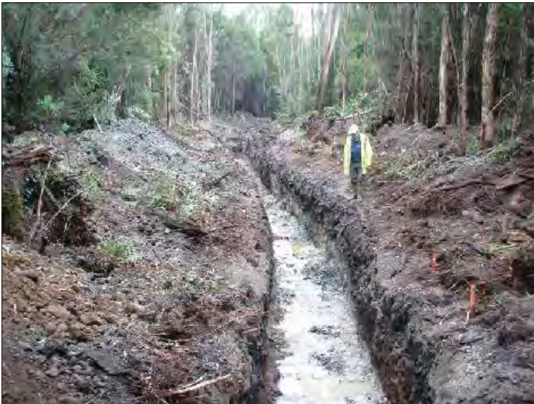
Costean at Stanley Reward showing topsoil to right and gravel to left.