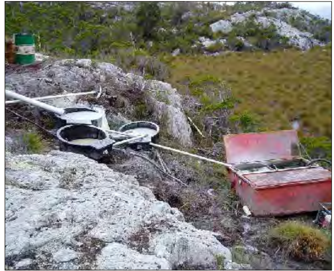
Remote area sumps that are working.