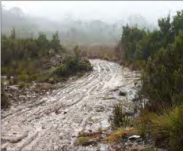
Drill track in use.