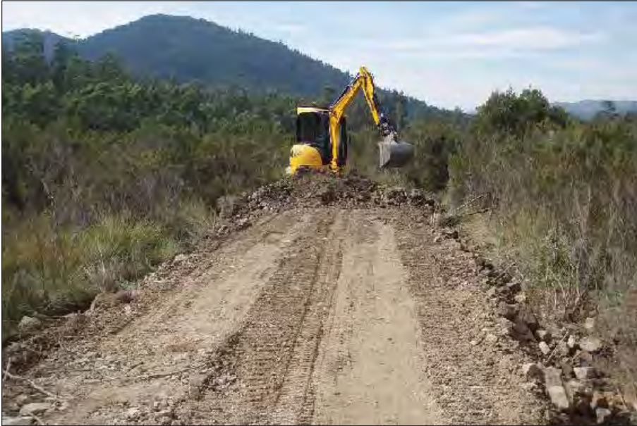
Track construction through buttongrass on peat — coarse fill from local borrow pit.