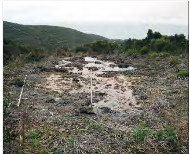
Attempts to seal hole failed because of poor collar.