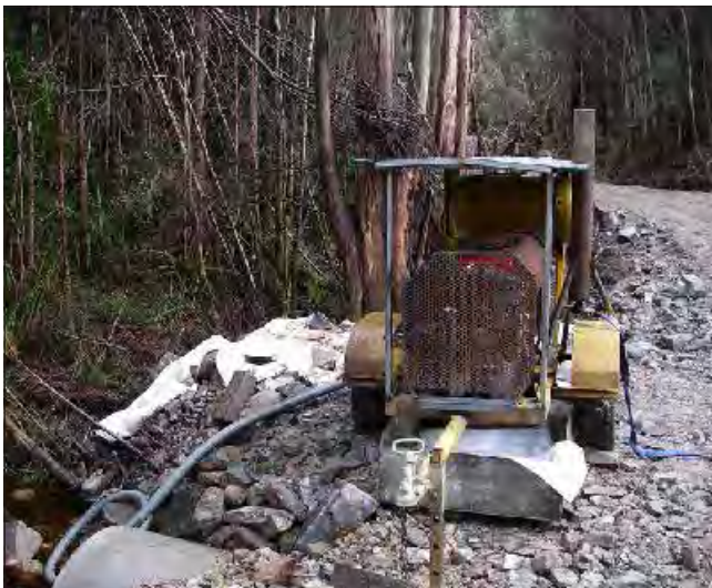
Roofed pump, fuel tank and bund.