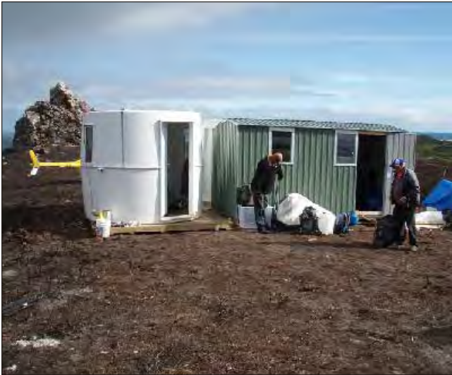
Hatted camp using converted rain water tanks as huts and a garden shed.