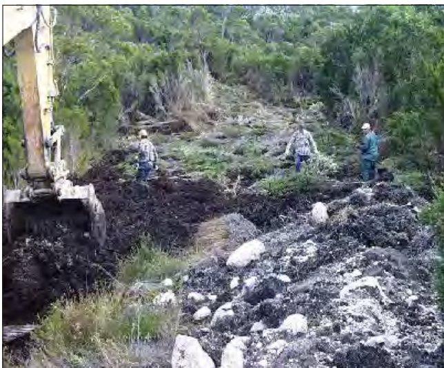
Spreading tea tree slash on drill access track.

On the whole, the use of fertiliser, especially in small amounts, is preferred to non-use. Use a fertiliser such as the off-the-shelf 8:4:10 or 6:5:5 plus magnesium mix, at a rate of no more than 250 kg/ha. At a rate of 250 kg/ha, one kilogram of fertiliser will cover 40 m 2 . One handful (approximately 100 g) will cover four square metres.