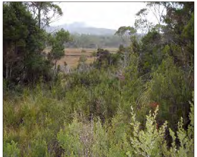
Drill track ten years after rehabilitation.