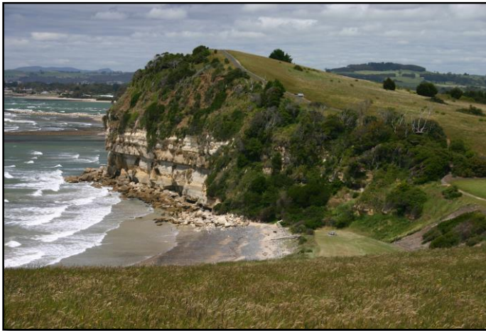
Active rock fall processes at Fossil Bluff, Wynyard