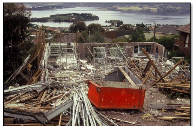
A near-new house being demolished (one of 15) after movement of a previously unknown deep-seated slide at Rosetta, Hobart.

Existing landslides present a danger in that they have the potential to reactivate, but there is also the danger that some previously unfailed slopes have the potential to fail as first-time landslides.