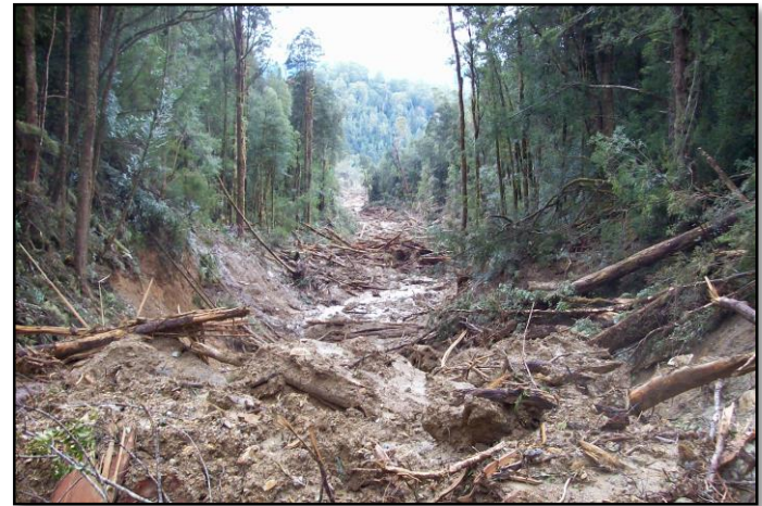
Recent debris flow near Philips Peak, western Tasmania