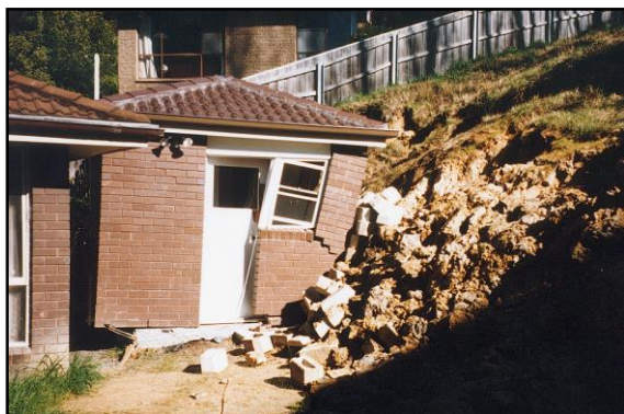
A building pushed off its foundations after a small, shallow slide caused failure of the adjacent retaining wall at West Hobart.

Over 150 buildings in Tasmania (including at least 125 houses) are known to have been damaged or destroyed by landslides since the 1950s — in all probability there are many more. As far as can be determined, no loss of life has occurred in this time, but such events can be highly traumatic to those directly affected. There is also considerable ongoing damage to infrastructure throughout Tasmania.