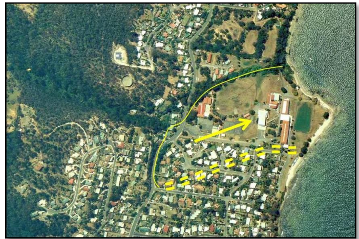
Active, slow moving, deep-seated slide at Tarooma