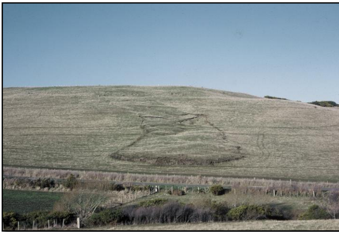
Recent, shallow earth slide at Evandale